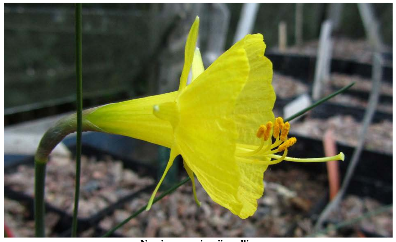
Narcissus romieuxii seedling

The next three pictures are all Narcissus romieuxii seedlings showing some of the variations that occur in this group. In most cases I know the seed parent but have no idea which flower the pollen came from so these may be crosses within the whole group. I love the deep yellow colour and conical corona of the one above – very elegant.