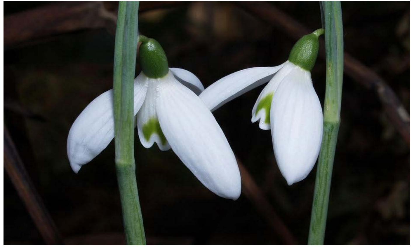
One thing for certain is that 'white fever' has started extra early especially down south where some specialists had 50 named cultivars in flower to pick for the Christmas table.

I showed a picture of this clump of Snowdrops in Bulb Log 0311 when they were slightly more advanced than shown here. Considering the big freeze we had during November and December 2010 it is a surprise that these Galanthus are not that far ahead of last year's timing leading me to think that there many different factors that come into play which affect when a plant will grow and flower – it is not just temperature.