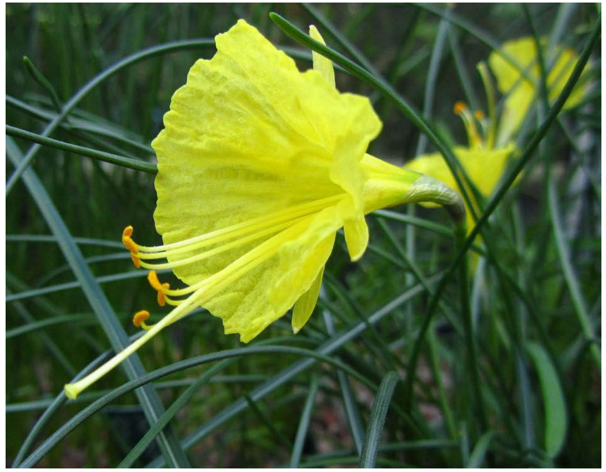
Narcissus romieuxii seedling

Yet another variation in the flower shape - note how extended the style and stamens are – well beyond the mouth of the corona.