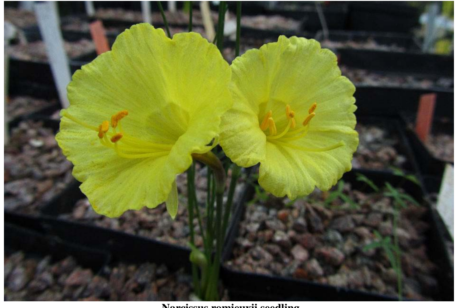
Narcissus romieuxii seedling

The next three pictures are all Narcissus romieuxii seedlings showing some of the variations that occur in this group. In most cases I know the seed parent but have no idea which flower the pollen came from so these may be crosses within the whole group. I love the deep yellow colour and conical corona of the one above – very elegant.