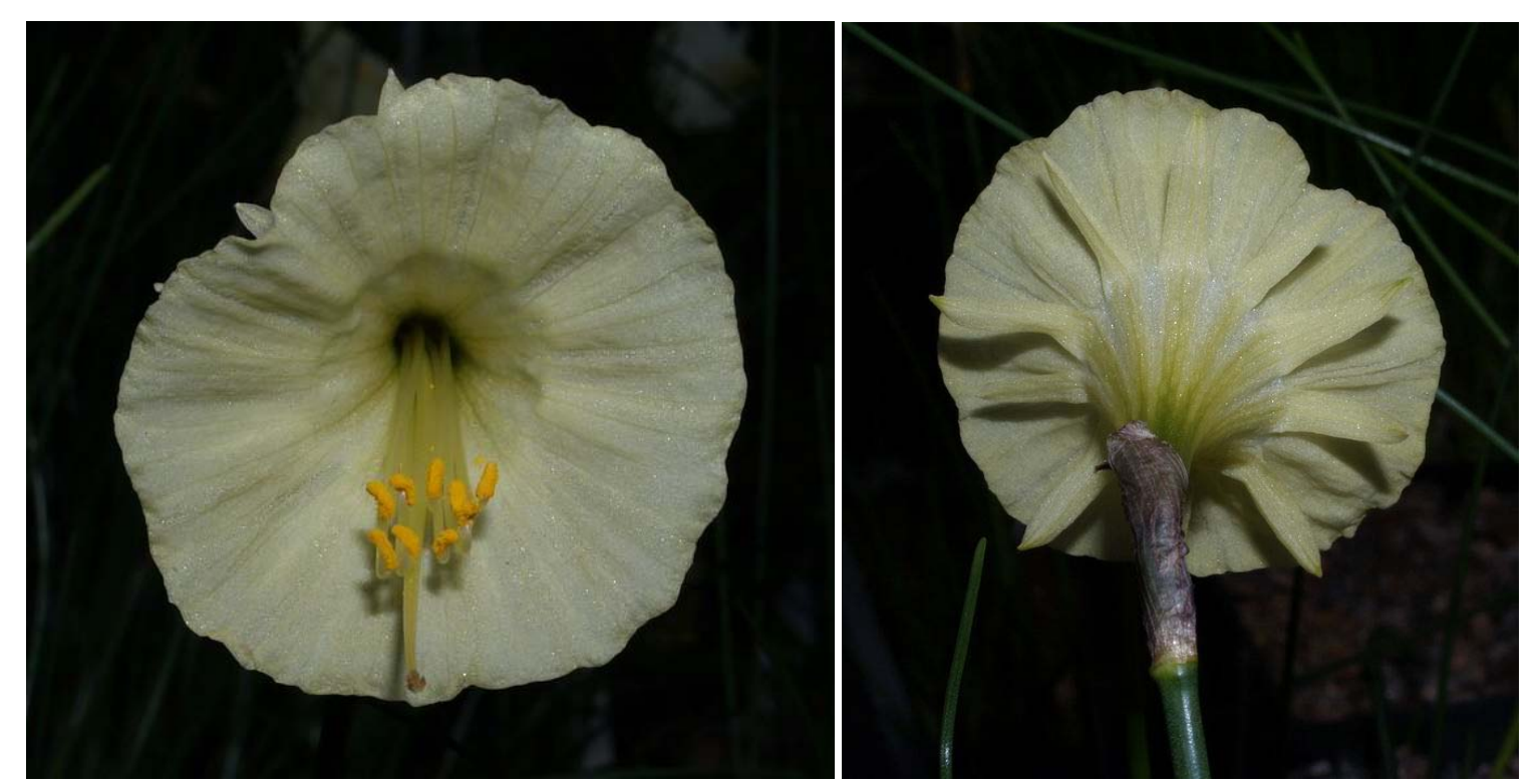
Narcissus romieuxii seedling

Observation is one of the best assets for any grower – being able to spot minute differences that make one bloom stand out. Looking into the face of this flower I was struck by the number of stamens – 9, three more than normal. I have learned over the years that when these Narcissus have extra stamens they usually also have extra petals and indeed there are ten petals.