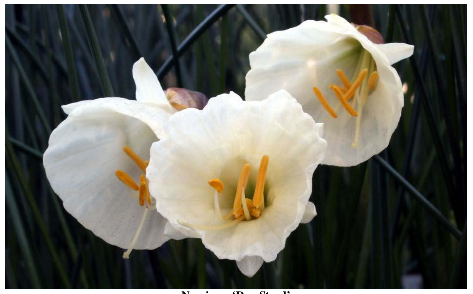
Narcissus 'Don Stead'